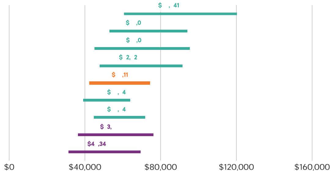
Annual Earnings of College-Educated Workers (Full-Time), by Undergraduate Major

$42,820 workers aged 22–26 $55,882 bachelor's degree only